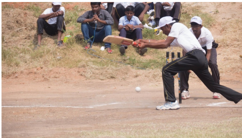
Example 4d: These Oriflame distributors gathered to play a game of cricket, an example of a sports setting