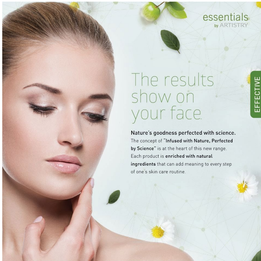
Example 2b: In this Avon example, the subject is deliberately not looking at the camera in a posed way. She is also unnecessarily touching her face