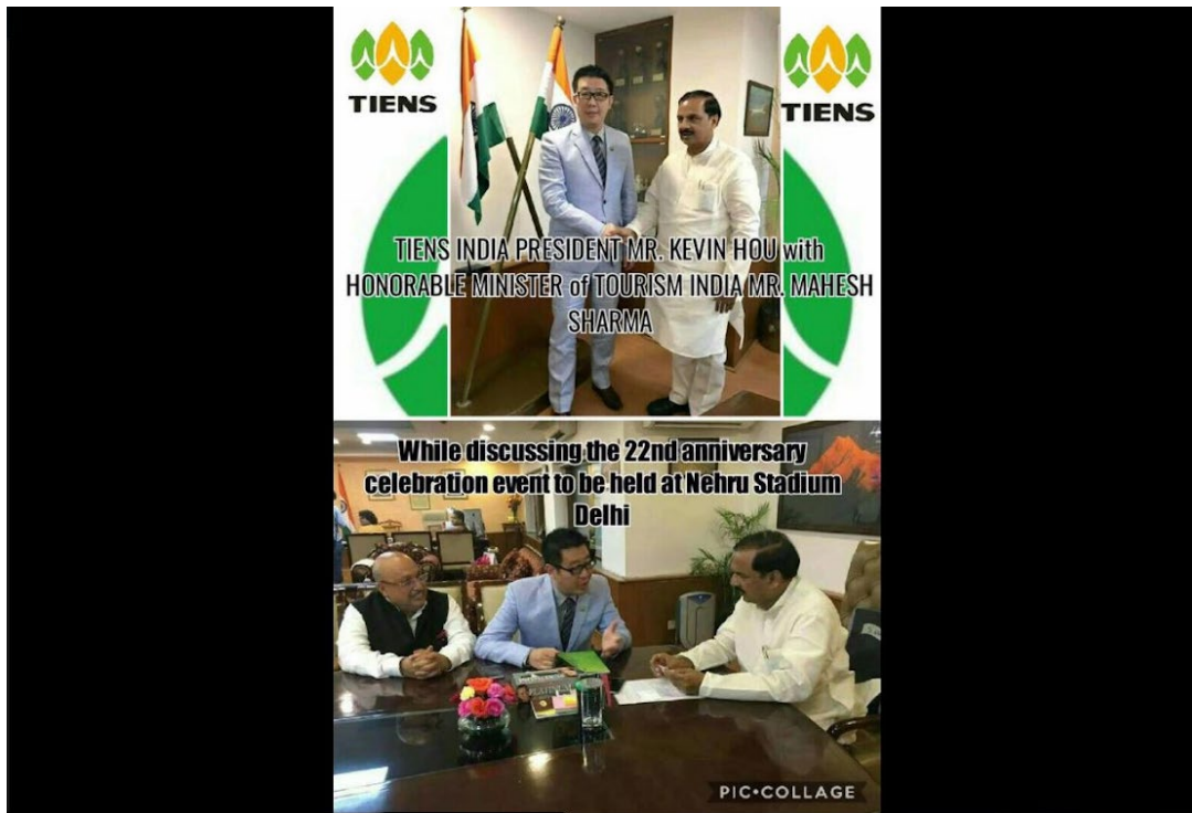
Example 4c: This TIENS example shows men meeting in business offices