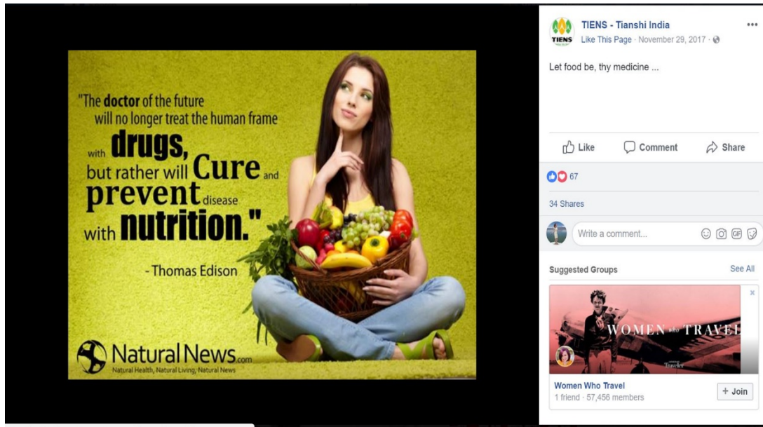
Example 3a: The subject is both canting her head to one side and unnecessarily touching her face (from category 2).