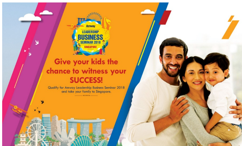
Example 3b: This woman is not only in a group, but she's also being held onto by the man