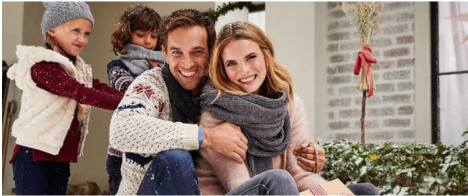
Example 4a: This Oriflame photo clearly shows the subjects together in a family setting